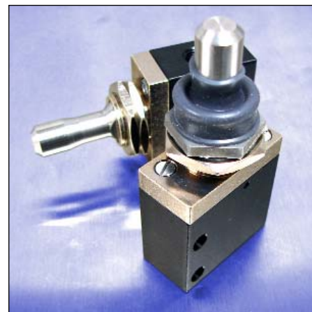
2-Position toggle valve shown with Heavy Duty toggle style (at left) and with Silicone Protective Boot (sold separately) installed (at right)